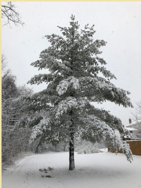
give me the pines, especially in winter when their crowns are adorned with blizzard blossoms

“It is much to be regretted that the very superabundance of trees in our state should destroy in some degree, our veneration for them. They are looked upon as cumberers (a thing that takes up space or gets in the way) of the land, and the question is not how they shall be preserved, but how they shall be destroyed.” Hopefully times have changed.