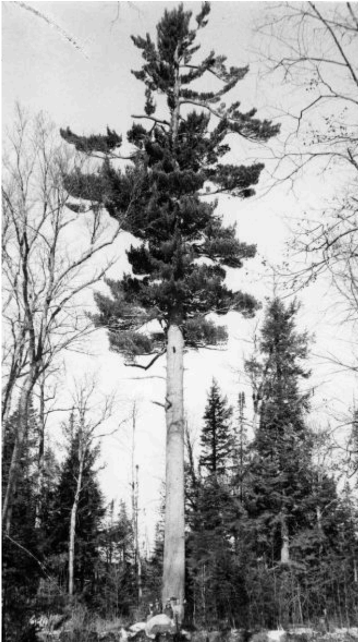
from Every Root an Anchor: Wisconsin's Famous and Historic Trees by R. Bruce Allison

As one of the largest known white pines in the United States, or the world, (its weight estimated at roughly 27 tons) it was certainly a magnificent relic of the past and one of the attractions that lured thousands of tourists annually to the Chequamegon-Nicolet National Forest.