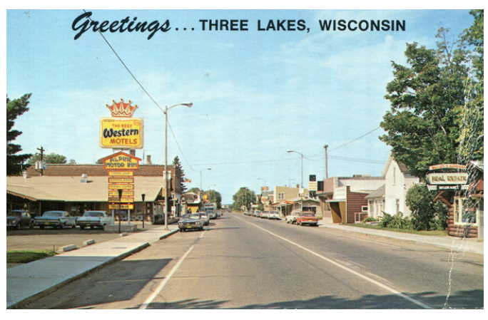
In the late 1960's, the looks of the iconic corner changed as the original building was torn down and replaced by the Best Western Alpine Motor Inn.