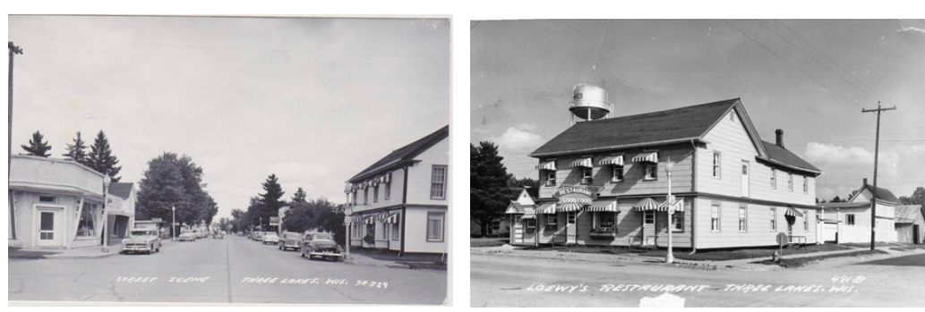
Loewy's Restaurant referred to by some as Loewy's corner