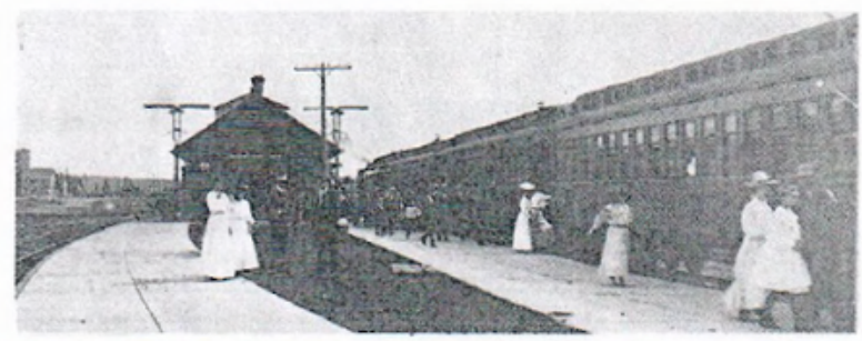
Monico Junction in the late 1890s or early 1900s. Note the white sidewalks and the double tracks, incoming and outbound. Sidewalks are of white marble. Monico Junction at that time was slated to become the county seat of Forest County, but political gerrymandering gave it to Crandon.

One of the largest employers to continue lending stability to the community was the Monico Excelsior Co. which started operations in 1908, continuing well into the 1920's, and then to the 1950's. The firm manufactured not only excelsior but cheese boxes, veneer and like products for the nation's packaging needs. Mostly birch, cedar, maple, spruce and balsam were used, plus of course, the ever-in-demand pine lumber! Gradually, with the end of the pine era and the decline in the agricultural potential during the drought and the depression years of the 1930s, this once thriving village gradually faded away with the final blow coming with the abandonment of the railroad in the 1980's.