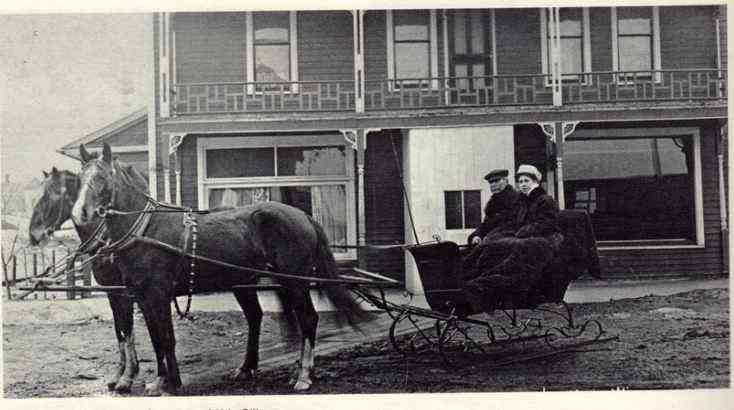
Hotel Northern, Monico.

Disaster plagued the community over the years, with fire heading the list. Early day fires wiped out several mills and sections of the village. Even as late as 1920 a fire roared through taking two stores, the post office, restaurant and seven or eight homes. Again, in 1923 the depot was leveled by fire.