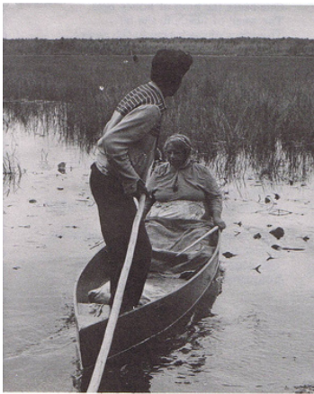
To the wild rice beds

The month of November was chosen for its cultural significance as the month when Native Americans conclude their traditional harvest season.