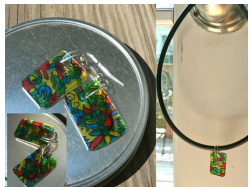
"The Shrinky Dinks Doodle Jewelry"

@Demmer Maple Room Lego Club is for children of all ages. Come and free build with your friends or play Lego Creationary.